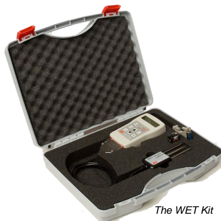
The WET Kit